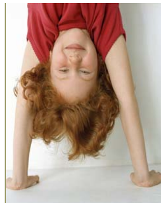
"Help save my innocence"

"Recent court cases have penalized child predators with community service, small fines and short probation."