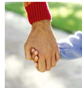
"Help keep today's children safe, they are depending on us"

"Recent court cases have penalized child predators with community service, small fines and short probation."